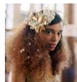
Rodarte, Spring/Summer 2018 backstage