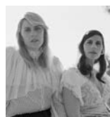
Kate Mulleavy (left) and Laura Mulleavy of Rodarte