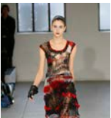
Rodarte, Fall/Winter 2008 runway; Courtesy of Rodarte; Photo © Dan & Corina Lecca