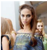
Rodarte, Spring/Summer 2012 backstage; Photo © Autumn de Wilde