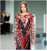
Rodarte, Fall/Winter 2013 runway; Courtesy of Rodarte; Photo © Greg Kessler/Kessler Studio