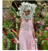
Rodarte, Spring/Summer 2018 runway