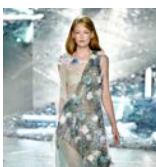
Rodarte, Spring/Summer 2015 runway; Photo © Greg Kessler/Kessler Studio