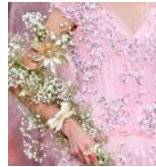
Rodarte, Spring/Summer 2018 runway