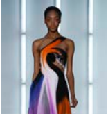
Rodarte, Spring/Summer 2009 runway