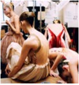
Rodarte, Fall/Winter 2008 backstage; Photo © Autumn de Wilde