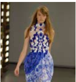
Rodarte, Spring/Summer 2011 runway