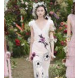
Rodarte, Spring/Summer 2018 runway