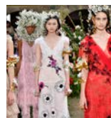
Rodarte, Spring/Summer 2018 runway