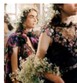
Rodarte, Spring/Summer 2018 backstage; Photo © Autumn de Wilde