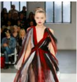
Rodarte, Fall/Winter 2008 runway; Courtesy of Rodarte; Photo © Dan & Corina Lecca