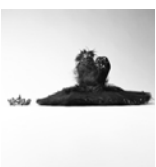
Rodarte, Black Swan costume, 2010