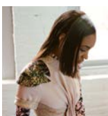
Rodarte, Spring/Summer 2013 backstage