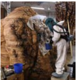
Ursula von Rydingsvard applying graphite through perforated plastic on for Stas (2011–17); © Ursula von Rydingsvard, Courtesy of Galerie Lelong & Co.; Photo by Morgan Daly