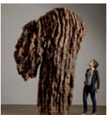
Ursula von Rydingsvard, For Natasha , 2015; Cedar and graphite, 9 ft. 1 in. x 6 ft. 7 in. x 3 ft. 6 in.; © Ursula von Rydingsvard, Courtesy of Galerie Lelong & Co.; Photo by Michael Bodycomb