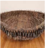
Ursula von Rydingsvard, Ocean Floor , 1996; Cedar, graphite, and cow intestines, 3 x 13 x 11 ft.; © Ursula von Rydingsvard, Courtesy of Galerie Lelong & Co.; Photo by Carlos Avendaño