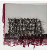
Ursula von Rydingsvard, Untitled , 2017; Fabric, string, lace, and pigment on linen handmade paper, 31 x 32 in.; Produced at Dieu Donn e, New York; © Ursula von Rydingsvard, Courtesy of Galerie Lelong & Co.; Photo by Etienne Frossard