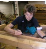
Ursula von Rydingsvard marking cedar, 2007