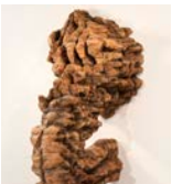
Ursula von Rydingsvard, SCRATCH II , 2015; Cedar and graphite, 10 ft. 1 in. x 6 ft. 3 in. x 4 ft. 11 in.; © Ursula von Rydingsvard, Courtesy of Galerie Lelong & Co.; Photo by Carlos Avendaño