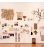
Ursula von Rydingsvard, little nothings , 2000–15; Items including cedar objects, drawings on paper, copper wires, photographs, tools, threads, and lace, dimensions variable; © Ursula von Rydingsvard, Courtesy of Galerie Lelong & Co.; Photo by Carlos Avendaño