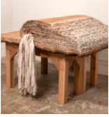
Ursula von Rydingsvard, Book with no words II , 2017; Cedar, linen, and leather, 10 ½ x 63 x 47 in.; © Ursula von Rydingsvard, Courtesy of Galerie Lelong & Co.; Photo by Carlos Avendaño