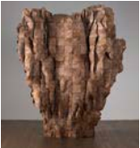
Ursula von Rydingsvard, Tak , 2015; Cedar, 5 ft. 2 in. x 4 ft. 2 in. x 2 ft. 2 in.; National Museum of Women in the Arts, Gift of Wilhelmina Cole Holladay; © Ursula von Rydingsvard, Courtesy of Galerie Lelong & Co.; Photo by Michael Bodycomb