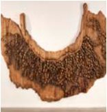
Ursula von Rydingsvard, Collar with Dots , 2008; Cedar and pigment, 9 ft. 7 in. x 11 ft. 5 in. x 7 ½ in.; © Ursula von Rydingsvard, Courtesy of Galerie Lelong & Co.; Photo by Carlos Avendaño