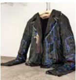
Ursula von Rydingsvard, PODERWAĆ , 2017; Leather, cotton, steel, and polyester batting, 10 ft. 9 in. x 8 ft. 6 in. x 3 ft. 9 in.; In collaboration with The Fabric Workshop and Museum, Philadelphia; © Ursula von Rydingsvard, Courtesy of Galerie Lelong & Co.; Photo by Carlos Avendaño