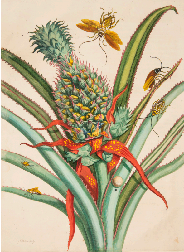
Plate 1 and Plate 18 from "Dissertation in Insect Generations and Metamorphosis in Surinam"