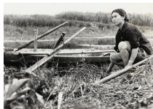
Above: Photograph of Hung Liu, ca. 1970–72