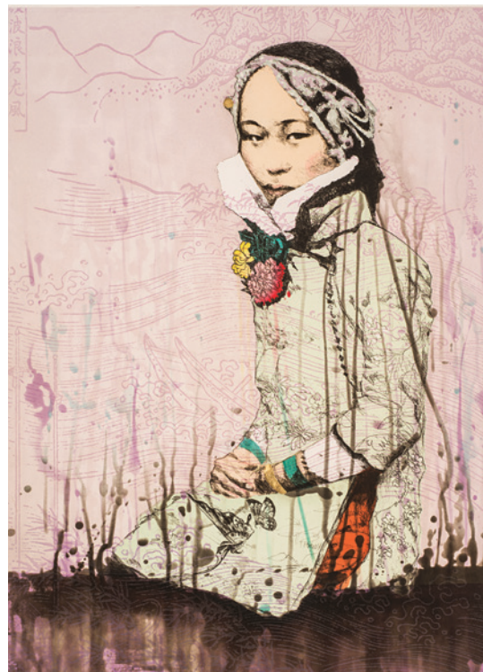
© 2023 HUNG LIU ESTATE/ARTISTS RIGHTS SOCIETY (ARS), NEW YORK; PHOTO BY LEE STALS WORTH

HUNG LIU WAS ONE OF TEN MILLION URBAN YOUTHS sent to re-education camps in the Chinese countryside during Mao Zedong's Cultural Revolution. She labored in rice and wheat fields in Dadu Lianghe, a village approximately fifty miles outside of Beijing. This experience influenced her deeply, inspiring her to view the working classes, the vulnerable and oppressed, and the voiceless with the utmost empathy—and to represent them with dignity in her art.