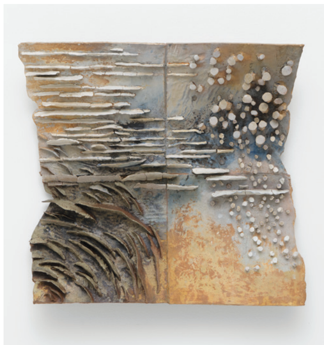
ILLINOIS // Ruth Duckworth, Untitled , ca. 1974; Ceramic wall relief, 40 3/4 x 44 x 7 1/2 in.; On view at the Smart Museum of Art

Initiated by artist Kirstie Macleod, the Red Dress traveled the globe from 2009 to 2022, augmented by nearly 350 people telling their stories through embroidery.