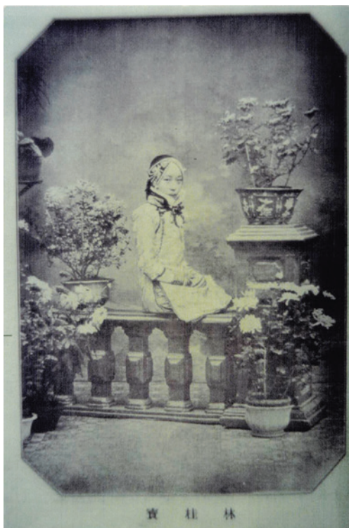
© 2023 HUNG LIU ESTATE/ARTISTS RIGHTS SOCIETY (ARS), NEW YORK

Shui-Water , 2012; Color aquatint etching with gold leaf on paper, 47 × 36 in.; NMWA, Gift of Steven Scott, Baltimore, in memory of the artist and in honor of the thirty-fifth anniversary of the National Museum of Women in the Arts