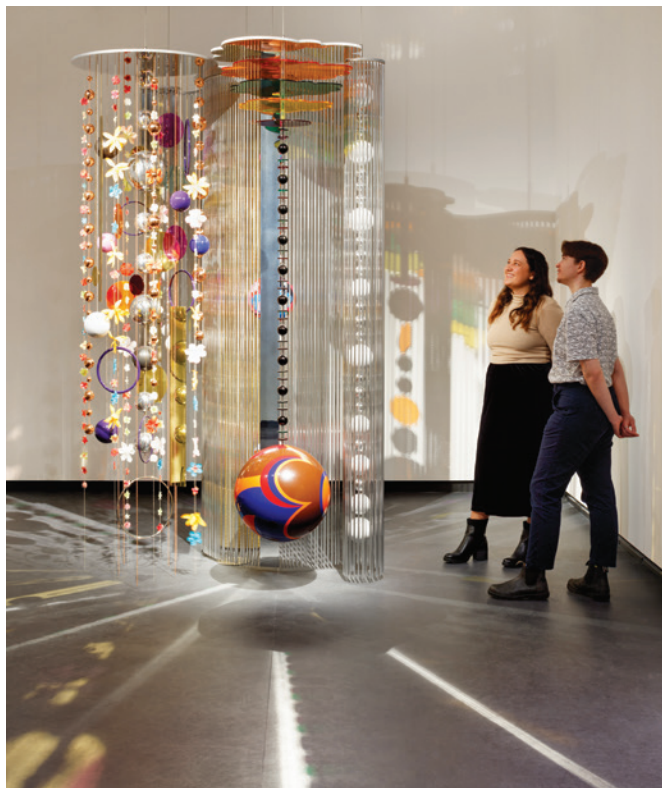
Visitors enjoy Beatriz Milhazes's Marola (2015) in The Sky's the Limit

Select Fridays. Jump-start your weekend with art! Join NMWA educators online for informal 45-minute art chats about selected artworks from NMWA's collection.