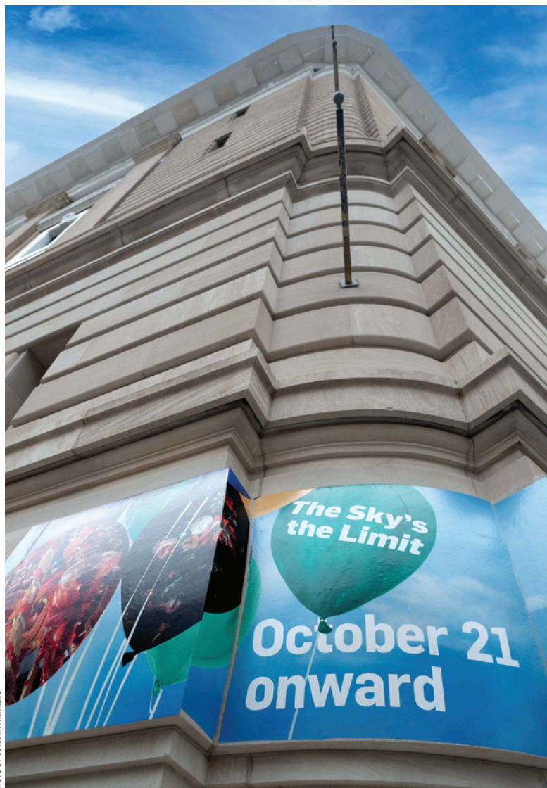
NMWA welcomed the public back into the renewed building on October 21