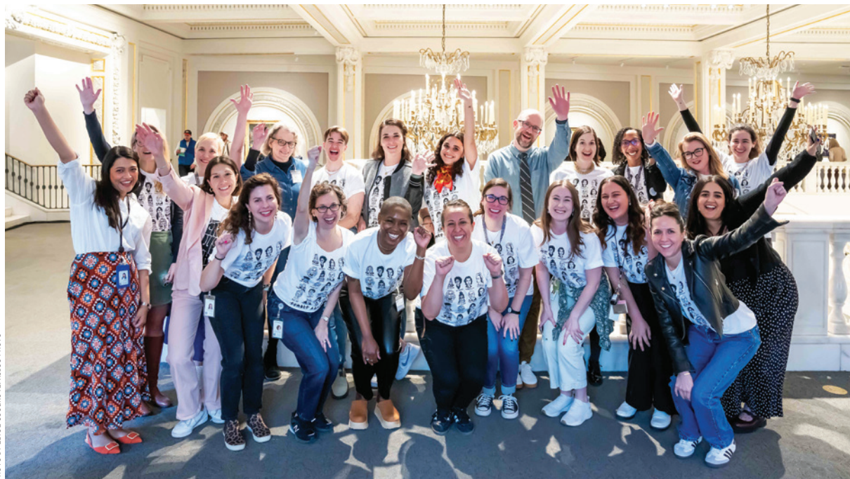
NMWA staff cheer for the museum's reopening